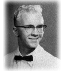
High School (needs help)

This is the third of a series of stories prepared entitled “Exceptional Dance Experiences.” This takes us back 38 years (ouch) to High School, where the raging hormones magnify everything and the smallest detail can become a catastrophe in a moment.