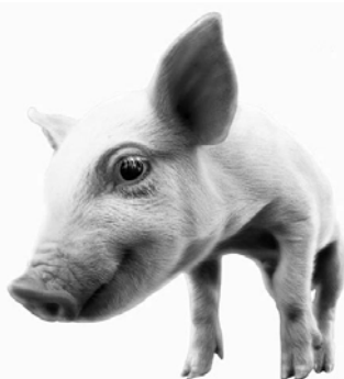
Nice little piggy

This caused what four decades later would be termed a “wardrobe malfunction.” The girl screamed, “ AIEEEE ”. Her date shouted, “ GET HIM! I SEE HIM – THE DOOFUS WITH THE HAT! ” Pointing at me.